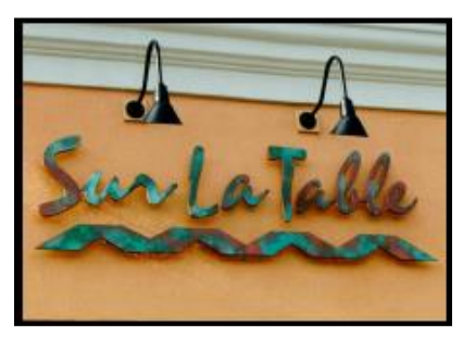
Externally Illuminated Sign

(3.) Backlit, individual letter signs (aka, halo lighting) are encouraged where illumination is needed as illustrated below.