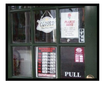
Example of Incidental Signs

(G.) Incidental signs affixed to windows containing no more than two (2) square feet in copy area provided that not more than a total of six (6) square feet of incidental signage is displayed per occupancy. An incidental sign may flash provided they are located within a building and no more than one such sign is displayed per occupancy.